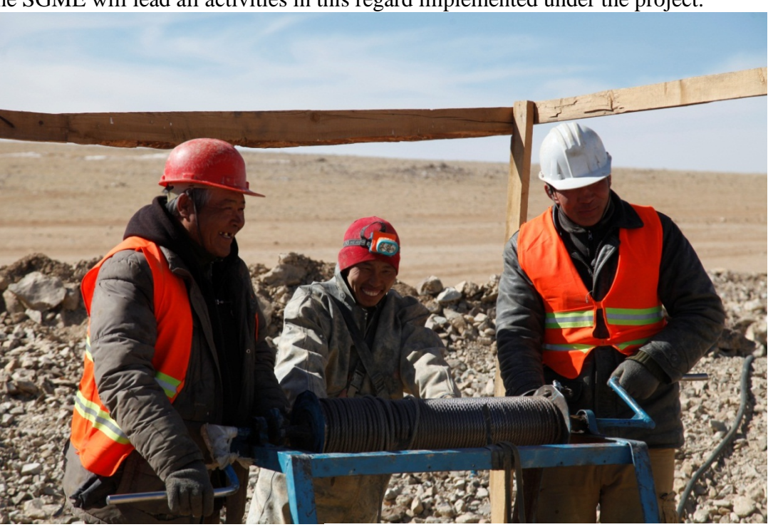
ASMers in Bayankhongor aimag, Mongolia

conducting a TVET needs assessment for ASM miners in the central region and is planning to develop the required TVET content. The SGME is working with the SAM Project to institutionalise ASM professionalism through the development of new professionals, the conducting of research, trainings and internship programs, and the development of ASM professional trainings. At present, the SGME is developing mining, geology, ore-processing and environmental training curricula for ASM miners. As a key institution involved in the professionalisation of the mining sector, the SGME will lead all activities in this regard implemented under the project.