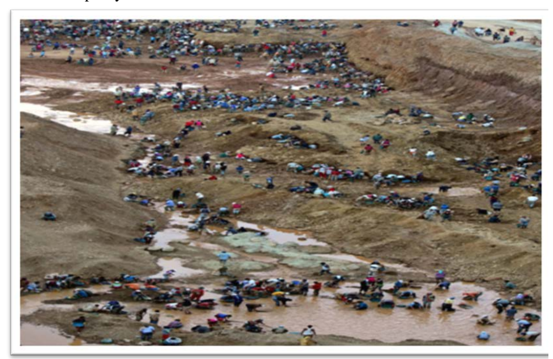
The informal operations of 500 ASM miners in Zaamar soum, Tuv aimag

Since its transition to a market economy in the early 1990s and in the aftermath of sequential climatic disasters that caused widespread poverty and unemployment in 2000, Mongolia has experienced an unprecedented mining boom, followed closely by an upsurge in informal and irresponsible ASM. By 2005, when the SAM Project was launched, there were an estimated 100,000 ASM miners operating throughout the country. The public viewed ASM as a temporary annoyance, with its crude methods of extraction, serious environmental impacts, illicit trade in minerals, poor safety conditions and paltry social welfare.